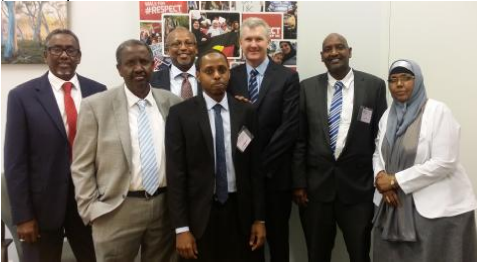
Qaar kamid ah xawaladleyda Somaalida Australia oo kulan kula le wasiirka maaliyadda ee mucaaradka magaalada Canberra, November 2014 kii.

Gudiiga waxqabadka waxaa kale oo kaalin dhexdhexaadineed oo muhiim ah uu ka qaatay fududeeynta wadhadalla dheeraad ah oo aay yeeshaan shirkadaha xawaaladaha iyo Bangiyada. Horraantii December 2014kii, dowladda Australia wexeey martigelisay kulan ay kasoo qeyb galeen dhamaan hey'adaha aay quseyso arimaha xawaladaha una dhexeeyay xiriirka bangiyada Australia, wakiilada afarta bangi ee ugu weeyn dalka Australia, shirkadaha xawaaladaha, wakiilada bulshada, iyo waaxyaha dowladda ee muhiimka u ah arrintan. Kulan kaasi waxaa diiradda lagu saaray sidii loo gaari lahaa xal lagu abuurayo kalsooni ka dhex dhalata qeybaha lacagaha dira iyo Bangiyada. Xiriirka shirkadaha xawaaladleeyda iyo kuwa lacag bixinta (ARCPA), iyo xawaaladaha Soomaalida waxeey la yimaadeen soo jeedin in kor loo qaado ku dhaqanka sharciyada shirkadaha xawaaladaha iyo shuruucda ayaga ugaarka ah si loogu dhaqmo sharciyada ka hor tagga lacag lunsashada/dhaqidda iyo la dagaallanka maalgelinta argagixisada (AML/CFT).